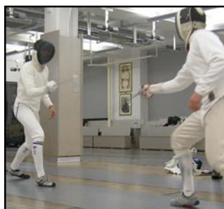
Public School Athletic League (PSAL) Training Program