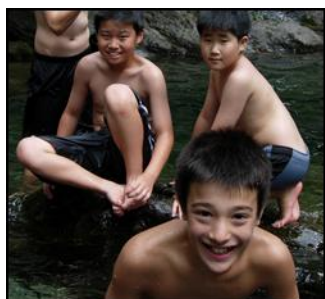
Summer Training Camp in the Berkshires