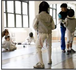
Youth School Programs