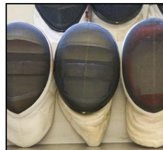
Training Programs Abroad