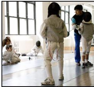
Youth School Programs