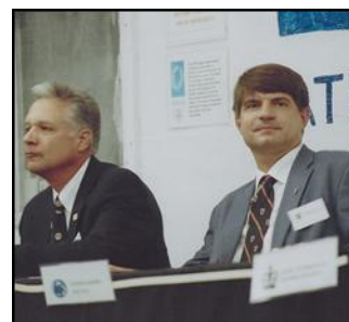
Annual Symposium on College Fencing