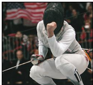
Competitive Athletic Scholarships