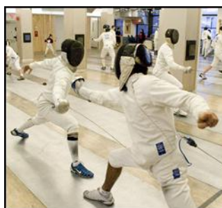
FC Winter Training Camps