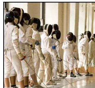
FC Summer Day Camp