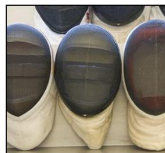
Training Programs Abroad