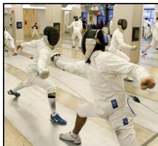
FC Winter Training Camps